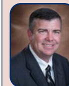
Judge Tramer J. Woytek Lavaca County

WE NEED YOUR SUPPORT DONATE ONLINE AT SUPPORTGULFBEND.ORG